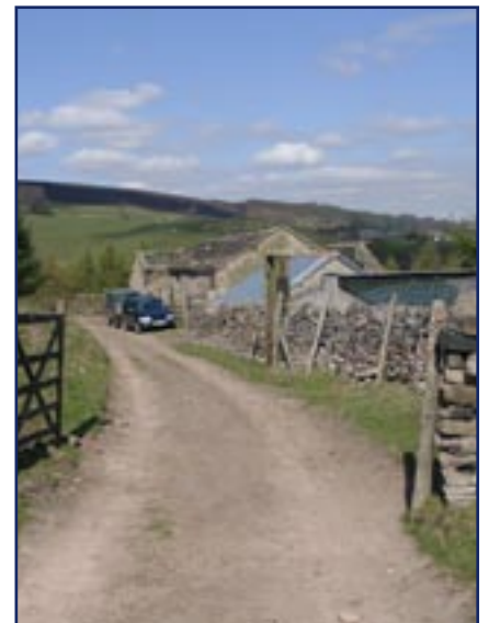
entrance to 'The Farm' - our smallholding in the Goyt Valley

Not all clients qualify for state funding, of course, but we have never seen this as a reason to turn anyone away. The inevitable shortfall this policy creates is made up by the generosity of our supporters: churches, Christian organisations, trusts and individuals.