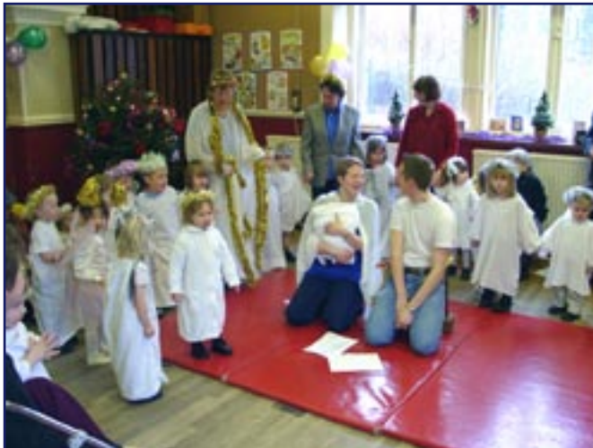
Nativity play - Buxton nursery

Good News Family Care is managed and staffed by a team of committed Christians who have a desire to share God's love in the community.